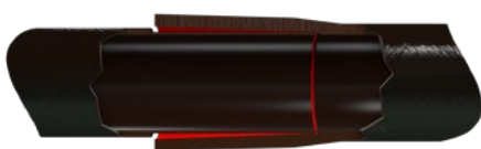
Quick-Lock™ adhesive-bonded joint